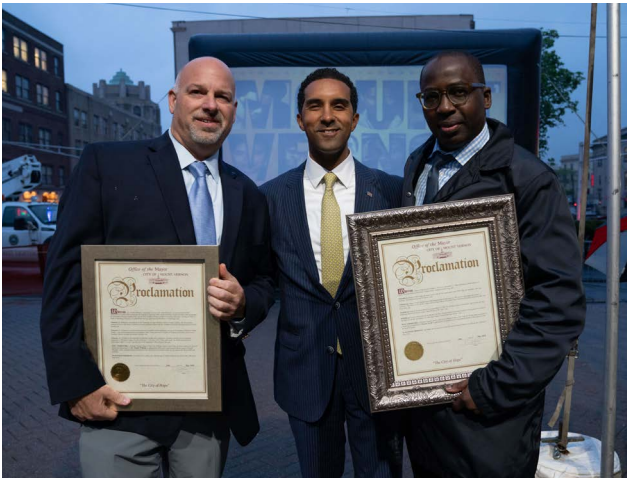
Mayor and Honorees Celebrate Mount Vernon Rising