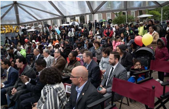
Mount Vernon Rising Audience