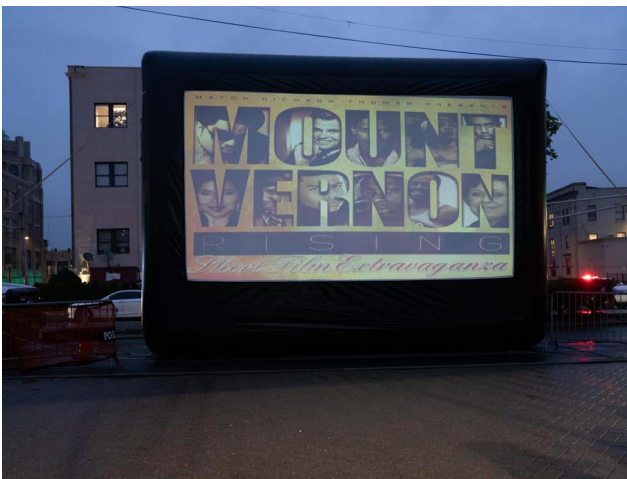
Mount Vernon Rising Film Begins