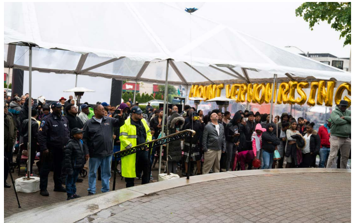
Mount Vernon Rising Audience