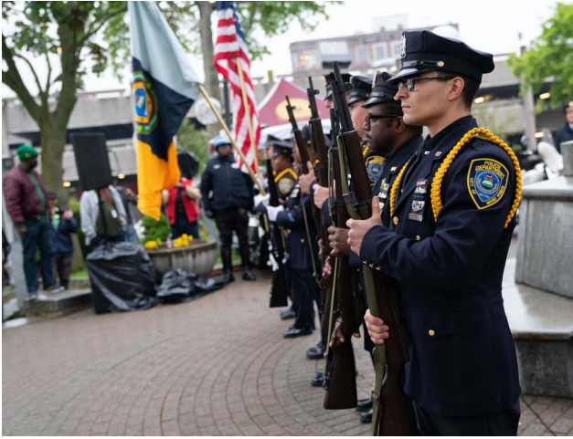
Mount Vernon Police Department